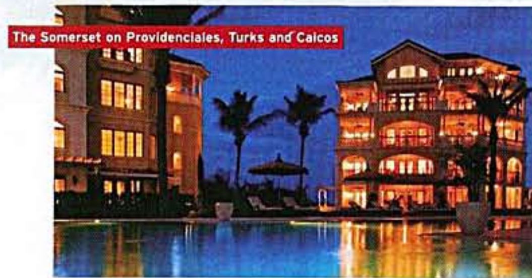
The Somerset on Providenciales, Turks and Caicos